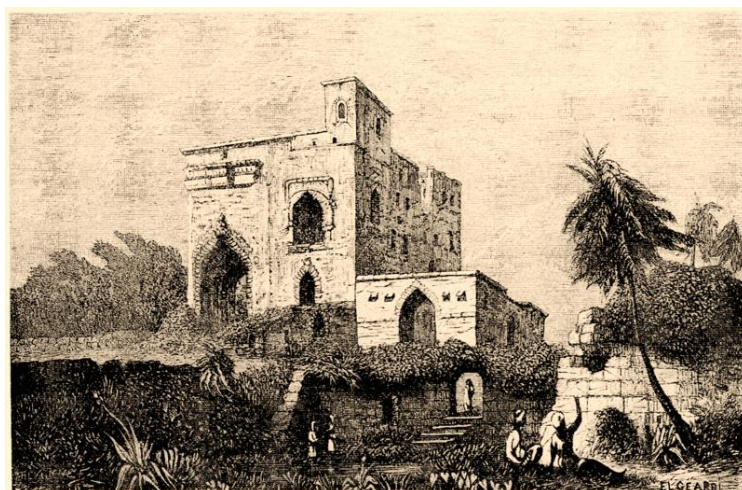
Fig.2 Ruins of the “Santa Casa” Extrait de "L'Homme et la Terre", di Eliseo Reclus

It seems appropriate to give here an information which Dellon gives later about the organisation of the Goan Inquisition (Chapters XVII and XXIII). “ There are two Inquisitors : the Grand Inquisitor is always a secular priest, the second a religious of the order of Saint Dominic ” (p.60, eng). While Dellon mentions three orders, the Dominicans (to which the Inquisition was entrusted), the Franciscans and the Augustins, as taking part in his Autodafé, he never mentions the Jesuits , who, apparently, at the time of his imprisonment, had no say in the Inquisition (they had had already two major clashes with the Dominicans and the Inquisition, especially in Spain, at the end of the XVI century).